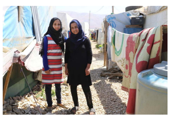
Syrian refugee girls living in an informal settlement in Lebanon.

Approximately one in five women report experiencing sexual violence during a humanitarian emergency.4