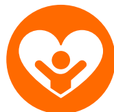
Mother and child care