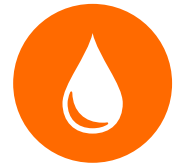
Clean water and sanitation