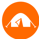
Crisis and conflict response